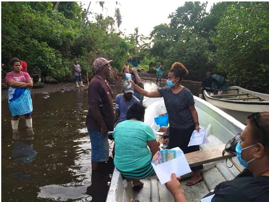
Cash distributions in one of the rural communities in the Northern Division as part of the TC Yasa Response. Due to Covid, ADRA Fiji team cannot access these villages thus only a rep from each household came to receive cash in envelope