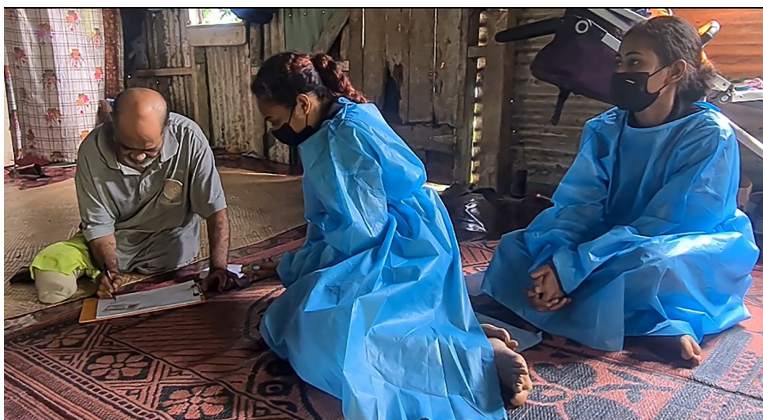
House to house Cash distributions to People with Disabilities who cannot access their cash assistance through e-transfer